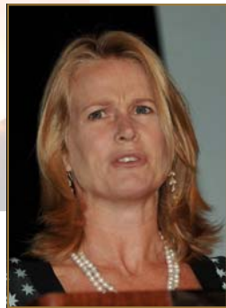
Keynote Katty Kay on Presidential Politics