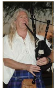
The Westin's bagpiper saluted sunset each evening.