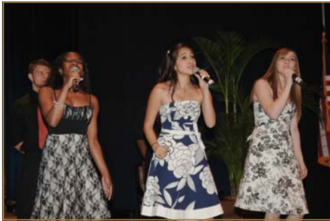
Voices of Valley Youth Theatre Performed before the First General Session... "Awesome!"